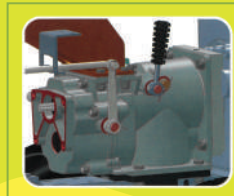
6 Gears Shifting Gear Box