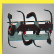
Wet Land Blades