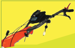
Handle-bar with LED light