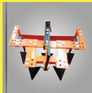
5 Tynes Cultivator