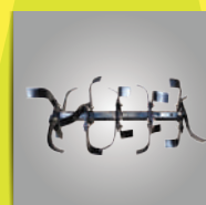
Dry Land L - Type Blades