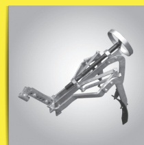
3 Tynes Cultivator