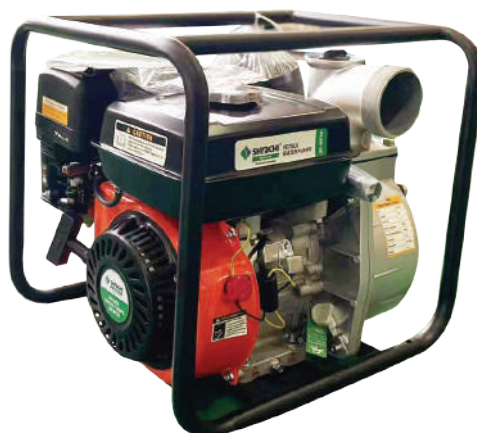
MODEL: SHRACHI WP-30