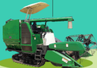
SELF PROPELLED (TRACK TYPE) HARVESTER CF8055D