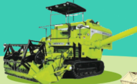
HARVESTER 360 T.A.F